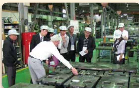
A visit to a precision instruments manufacturer in Tottori

To the participants, the Seminar had not only been a trip to learn about the latest policies of Japan, but also a valuable occasion to get acquainted with counterparts from different countries and deepen the cultural understanding among them.