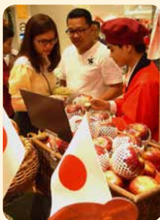
Promoting Japanese apples to Thai consumers

In an effort to support Japanese local governments that are eager to look for opportunities to market their local food products overseas, CLAIR has been organizing a food fair entitled “Japan Local Specialty Fair” which features famous local food products sourced through local governments from across Japan. The fair was held in Shanghai in FY 2010 and in Hong Kong in FY 2011 and 2012, all of which were extremely well-received by the consumers, hosting department stores and the participating food companies. In FY 2013, CLAIR held the Japan Local Specialty Fair for the first time in Siam Paragon department store in Bangkok, Thailand, which is emerging to be an important market in Southeast Asia for Japanese food products.