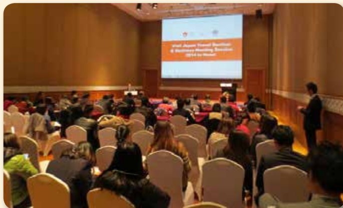
Participants from the travel industry in Hanoi listening to the seminar

opportunity to gather more information about travel in Japan. This year, a total of 14 groups from Japan, including 4 Japanese local governments and related organizations, as well as an estimated 83 participants from the local travel industry in Philippines attended the event.