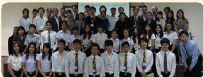
Group photo of the participants during the Cultural Exchange Program

One main focus of the program is to enable participants from Japan to obtain insights on the latest reforms and