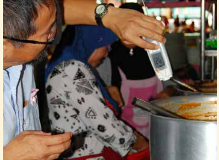
Site inspection at a local restaurant

the relevant advice to restaurant owners on sanitation management. The specialist also conducted relevant trainings on different food sampling techniques to the staff of Kuala Lumpur City Hall's Food Laboratory.