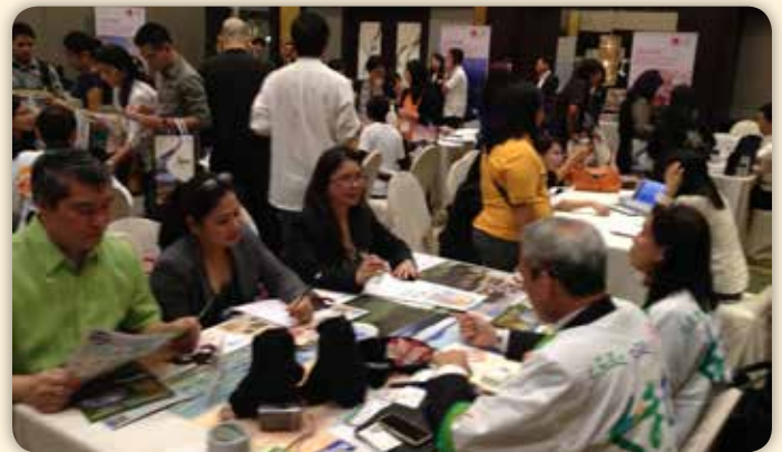
Business-meeting session at Philippines

A 'Visit Japan Travel Seminar and Business-Meeting Session' was similarly held in Manila in December 2013, organized by JTA and JNTO Bangkok Representative Office. CLAIR Singapore was a supporter of the event and had also participated in the business-meeting session by setting up an information desk that provided general travel information on various local regions in Japan. Following last year's inaugural event, this was the second time that such a Japan travel seminar and business-meeting session was being held in Manila, and many of the participants from Philippines indicated that they were happy to see such events being held regularly as it provides them an