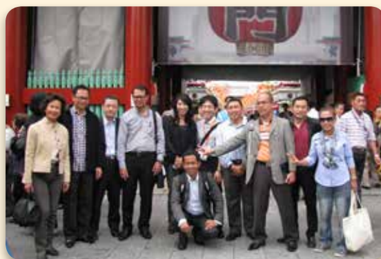
Visit to Asakusa area in Tokyo