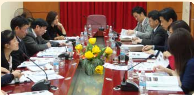
Meeting between delegates from CLAIR Singapore and MOHA, Vietnam

CLAIR Singapore hopes to continue to further enhance the collaborations and exchanges between Japan and Vietnam through our various programs, and looks forward to maintaining close and cooperative relations with our counterparts in Vietnam.