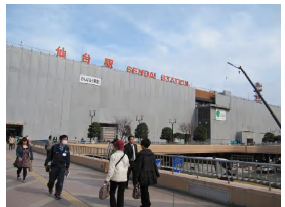
Sendai station is now under repair to prepare for the restart of the Shinkansen.

Public transportation in Tohoku region is still suspended in some places due to the disaster. However, it is steadily recovering now. The flights between Tokyo (Haneda Airport) and Sendai have already started since April 13th, and the Shinkansen will start their operation between Tokyo and Sendai on April 25th. Our lives gradually become as usual!