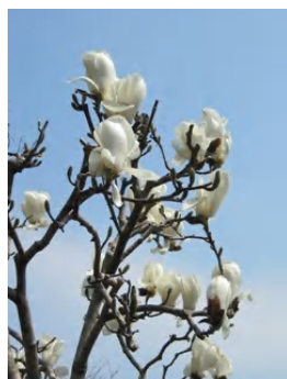
Yulan Magnolia is also a common sight in the spring in Sendai.