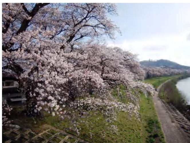
Hitome Senbon-zakura (一目千本桜) 1,000 Cherry Trees at a Glance