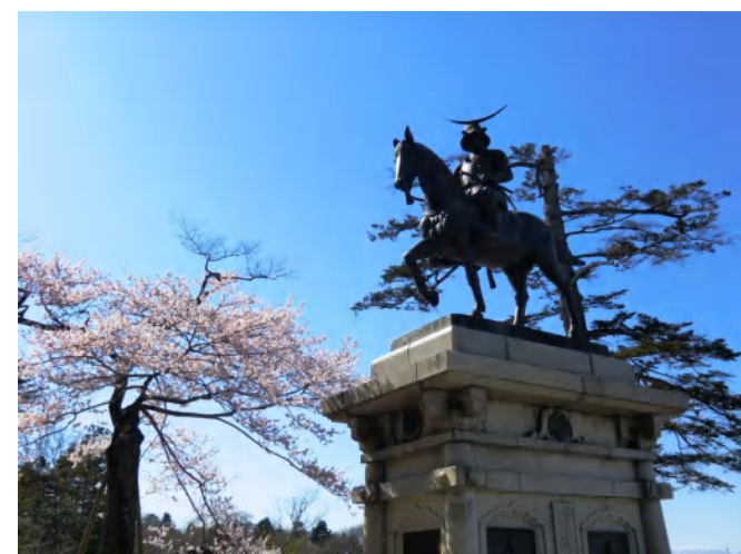
Sendai Castle site (仙名城跡)