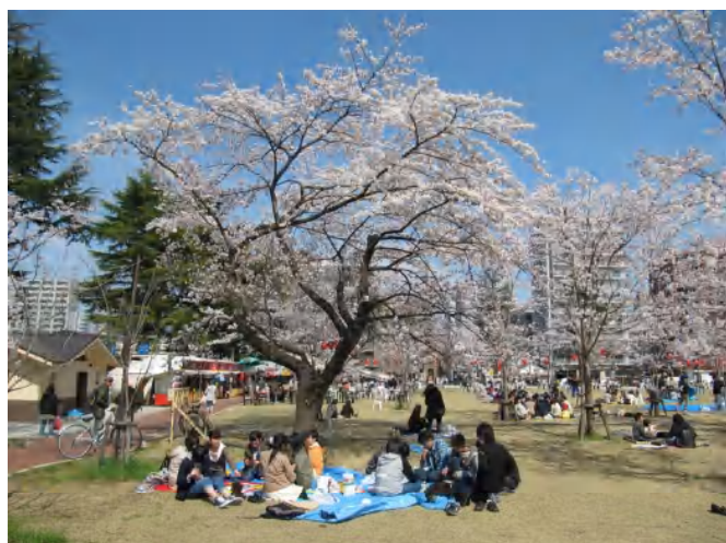
Nishi-park (西公園) – people enjoying Hanami Party