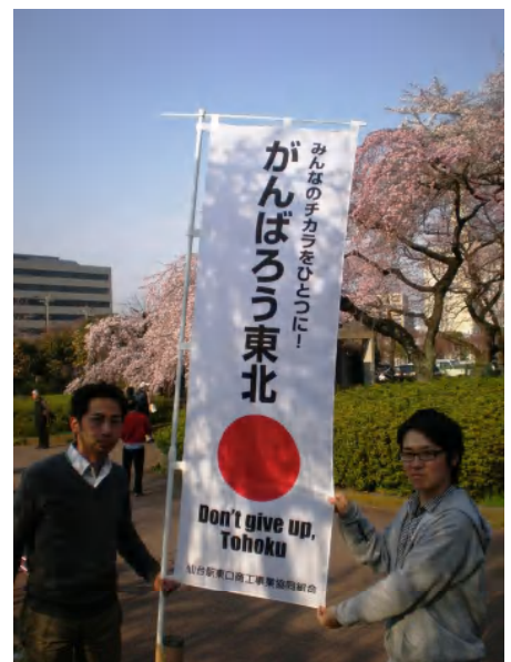
「がんばろう」(Gambaro) means "Move forward together!"