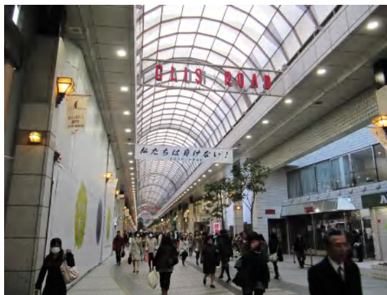
People gradually come back to downtown - Chuo-dori Avenue (中央通)

Because of the effort of the people in Sendai, and thanks to the support from all over the world, Sendai is now recovering step by step!