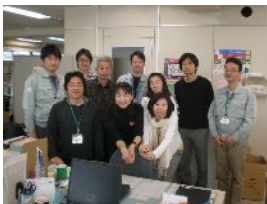
We will send news!

We would like to let you know the current news of Sendai with this paper.