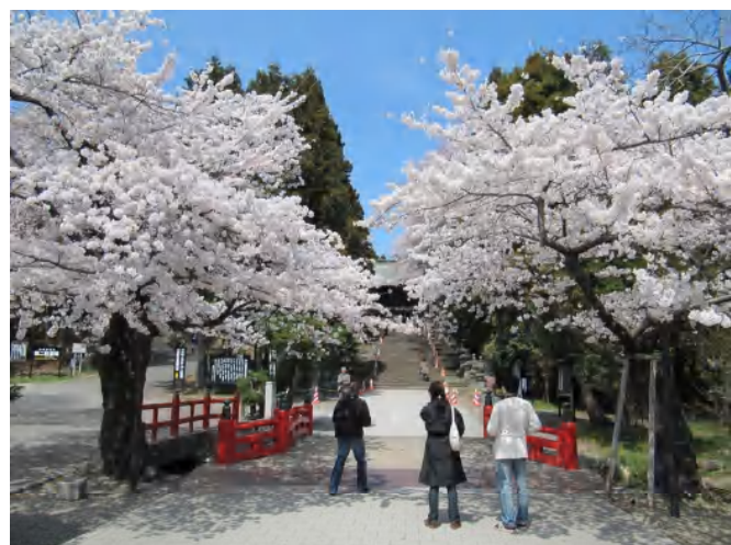
Sendai-Toshogu shrine (仙台東照宮)